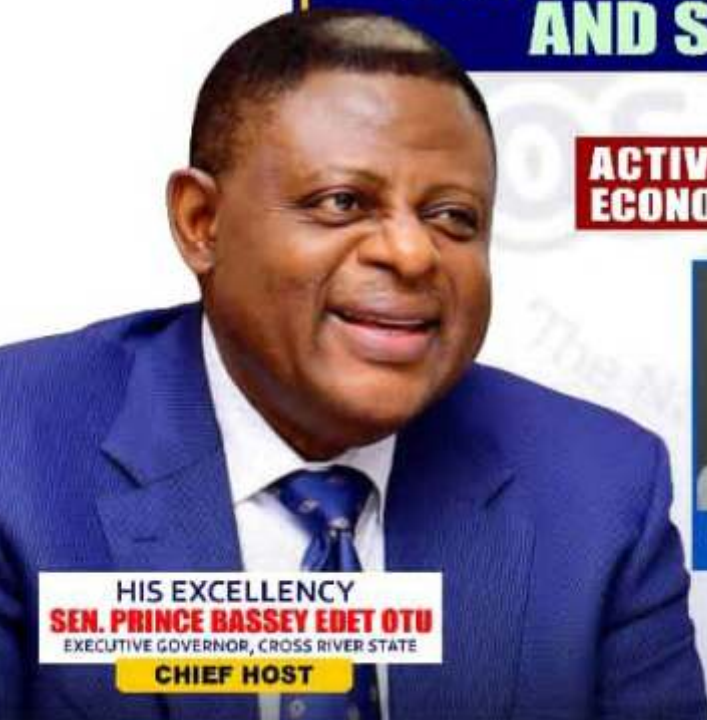
HIS EXCELLENCY SEN. PRINCE BASSEY EDET OTU EXECUTIVE GOVERNOR, CROSS RIVER STATE

ACTIVATING THE AUTOMOTIVE ECONOMY IN CROSS RIVER STATE